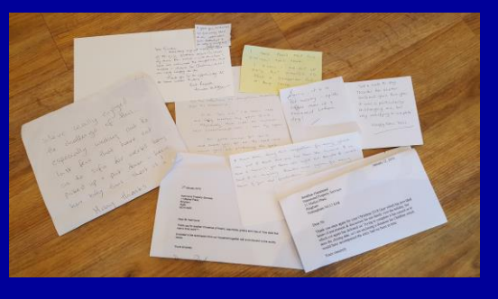
A few of the many letters that have arrived from entrants... with a wide range of comments and thanks and frustration and a great deal of pleasure having finally solved the last clues! Oh, and thoughts as to how difficult this year's quiz has been!